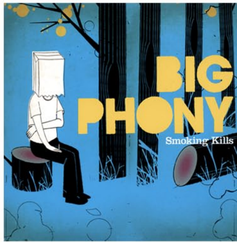
"Smoking Kills, EP" - 2006