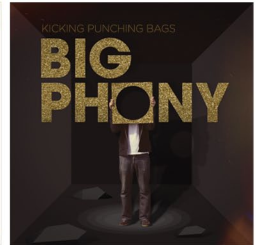
"Kicking Punching Bags" - 2009