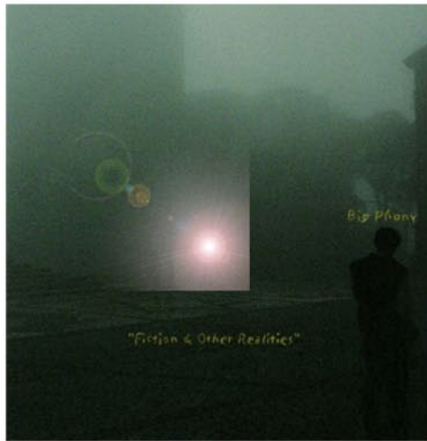
"Fiction & Other Realities" - 2005